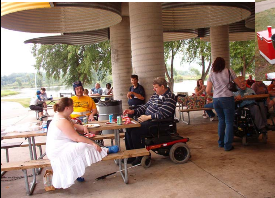
People gathered at Warner Park Shelter