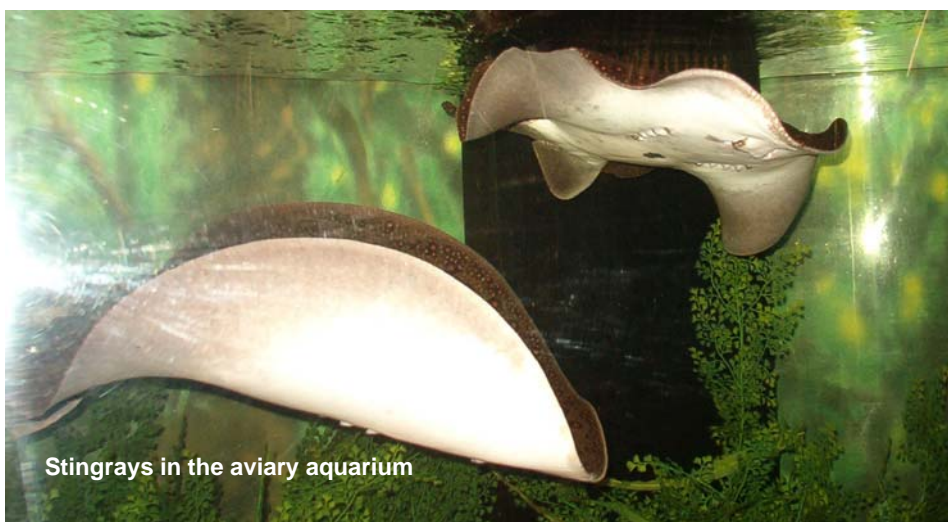
Stingrays in the aviary aquarium