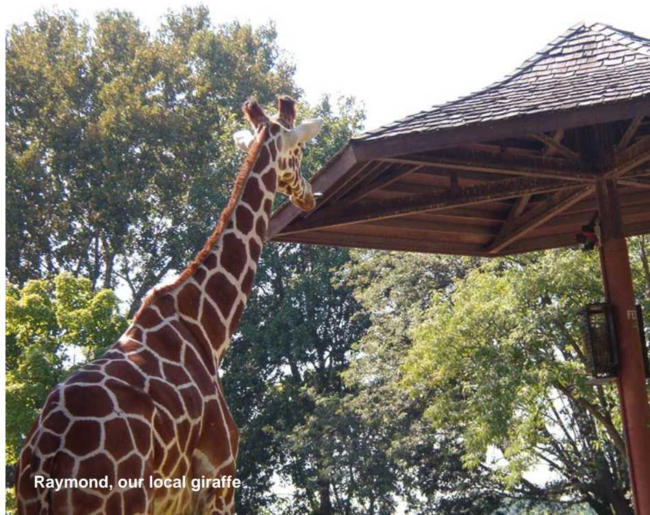
Raymond, our local giraffe