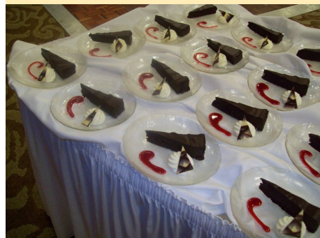
Dessert at the Arc Winter Ball

Arc-Dane County had a winter ball. They had chicken wings, meat balls and egg rolls. There was also cake, soda and chips. They always have great food. They gave out corsages with flowers. There was a DJ who played music and people danced on the dance floor.