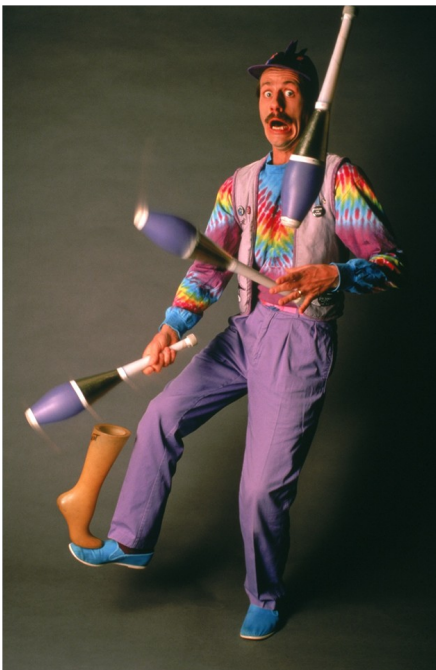
Truly Remarkable Loon Photo from www.trloon.com